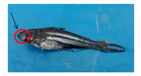
Fig. 3. White spot on treatment c