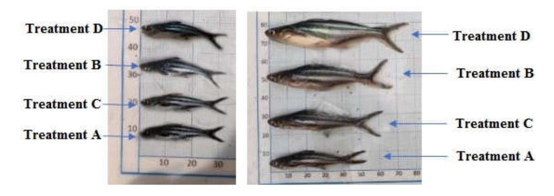
Fig. 2. Growth of catfish fry

Meanwhile, the survival rate of catfish fry in treatments b, c and d by using fbs showed higher results compared to treatment a (control). Fbs were able to maintain water quality by providing enough dissolved oxygen for fish. Dissolved oxygen is one of the limiting factors in water. Fish activities will be disrupted if the availability of dissolved oxygen is not sufficient to meet the needs of fish in aquaculture. Low levels of dissolved oxygen will inhibit the process of decomposition, reproduction and growth of fish will be hampered. Lack of dissolved oxygen will cause fish to lack appetite and the development of bacteria which will cause death in fish [16]. Fbs have a positive effect on fish survival which is able to form good environmental conditions which is able to increase oxygen concentration, reduce ammonia concentration so as to reduce stress levels in fish [17].