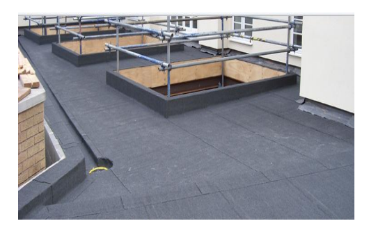
Fig. 3. Moisture proofing using asphalt