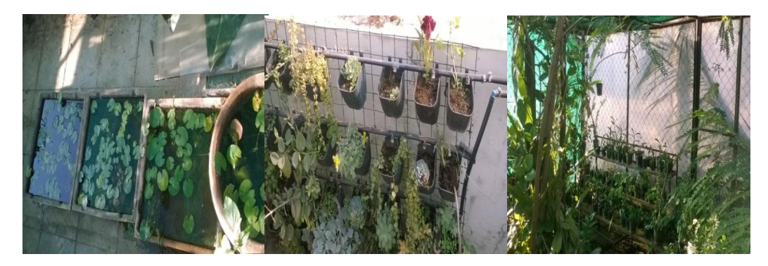
Fig. 1. Arrangement of pots in the roof top gardens