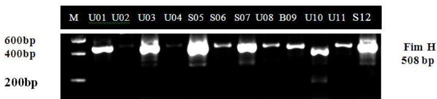
Fig. 1. Fimbria adhesin gene PCR products (chromosomal DNA) agarose gel image. Lane 01 to 12, are isolates that harbours fim1 gene with expected amplicon size of 508 bp [17] (Jalali et al., 2015). Lane M is molecular marker (1kb DNA ladder, Bioline, UK). Lane C is a control strain, ATCC 3450 (Virulent E. coli ). The figure shows that the isolates, U01, U03, S05, S06, S07, U08, B09, U10, U11 and S12, harbour FimH gene

N.B: Zones of inhibition was interpreted according to BSAC, 2013 guidelines