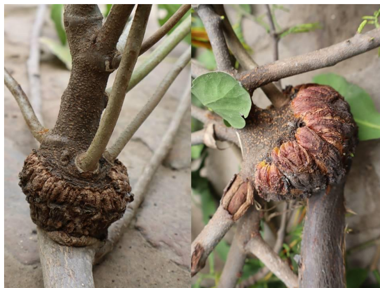
Fig. 2. Close view of galls in poplar (left) and melia (right) trees