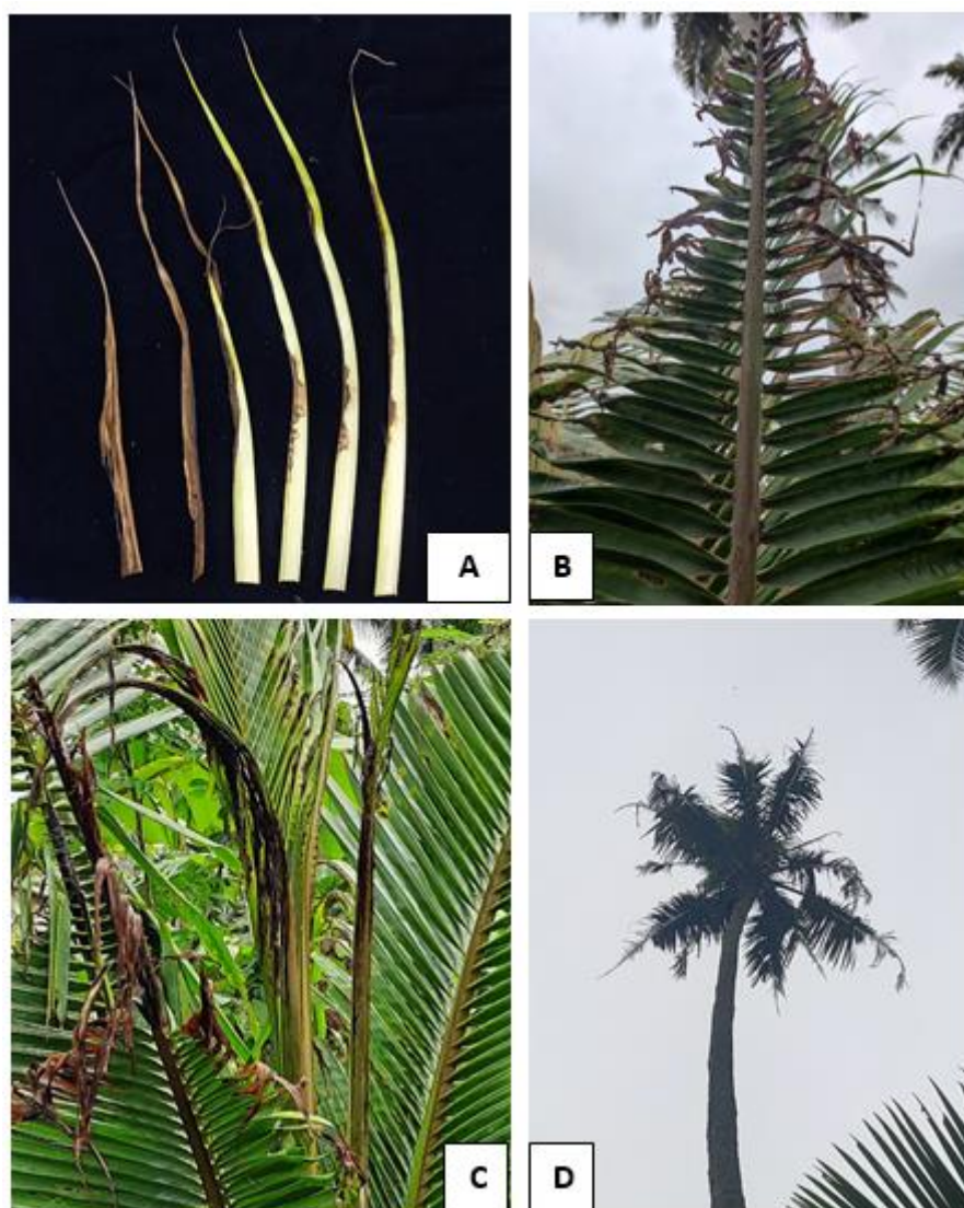
Fig. 3. (A) Deterioration of the spindle leaves, (B) Rotten tips of the leaflets (C) Extensive rotting of leaves (D) fan-like appearance of crown

Rajagopal et al. (1986) studied the water relations of infected palms, noting that LRD significantly disrupts stomatal regulation, leading to excessive water loss and impaired water uptake, ultimately causing wilting. Phytoplasma-infected palms, such as those affected by RWD, undergo physiological changes that weaken their defence mechanisms, making them more susceptible to LRD. Increased free amino acid concentrations in tender leaves of RWD-affected palms may explain the heightened susceptibility to fungal infections (Pillai and Shanta, 1965). In palms affected by both LRD and RWD, the crown becomes disfigured, and the palm declines rapidly, necessitating further research to understand this interaction. LRD spreads through