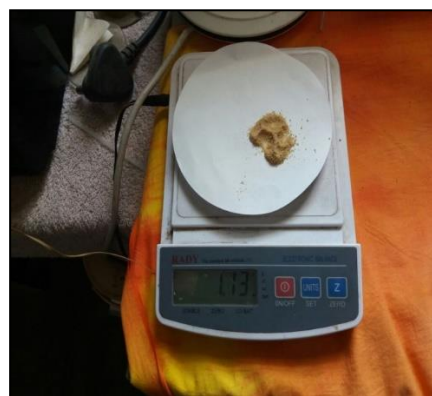
Fig. 4. Sample kept on weighing machine