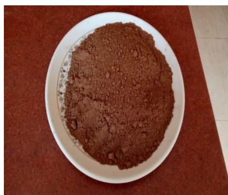
Fig. 2. Cluster fig Powder