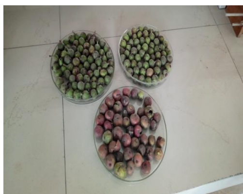
Fig. 1. Cluster fig fruit

Cluster fig, known for its rich medicinal properties, has been used for centuries to prevent and cure various ailments. This powerhouse of health benefits is particularly beneficial for women and adolescent girls. Its phytochemicals act as bioactive substances that aid in disease prevention and treatment. For women, cluster fig can help alleviate conditions such as mouth ulcers, oral infections, and menorrhagia, providing relief and promoting overall health. Adolescent girls can benefit from cluster fig's ability to treat skin conditions like pimples and freckles, as well as its potential to protect against urinary disorders and promote healthy growth during pregnancy. Its therapeutic uses extend to treating dysentery, burns, and even diabetes, making it a versatile and valuable addition to one's health regimen. The study was undertaken to incorporate the cluster fig in the diets of adolescent girls to utilise their health benefits.