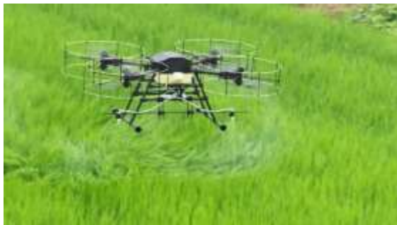
Fig. 2. Pollination assistance through drone

be affected by the effects of drought. Thermal image-derived variables frequently use minute temperature changes to identify stresses and other phenomena. Therefore, regression equations and thresholds that are derived under specific conditions typically do not hold under even slightly different conditions. For instance, due to innate variations in stomatal conductance and transpiration rates, different genotypes of a given crop may present significantly different canopy temperatures under the same conditions [29].