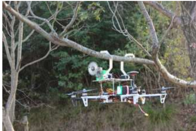
Fig. 4. Yield estimation through drone

the balance between crop growth and environmental conditions. As technology continues to evolve, the integration of drones into canopy management practices is likely to become even more sophisticated, offering farmers precise insights for enhanced crop health and productivity [36].