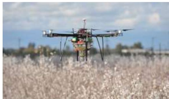
Fig. 3. canopy management through drone

Automated pollinator, a startup out of New York has created a pollen dump drone to aid in the pollination of fruits like apples, cherries, and almonds. They claimed that the drone rate could reach 65% instead of just 25%.