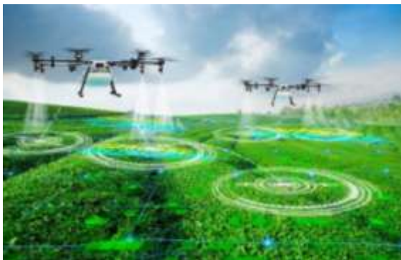
Fig. 1. Water distribution technique

Orange orchards in Florida developed applications for oranges. Orange orchard yield mapping system that is automated. Large bins were used to collect the fruits. A system of load cells mounted on the truck was used to weigh the bins as they were loaded onto the vehicles [23].