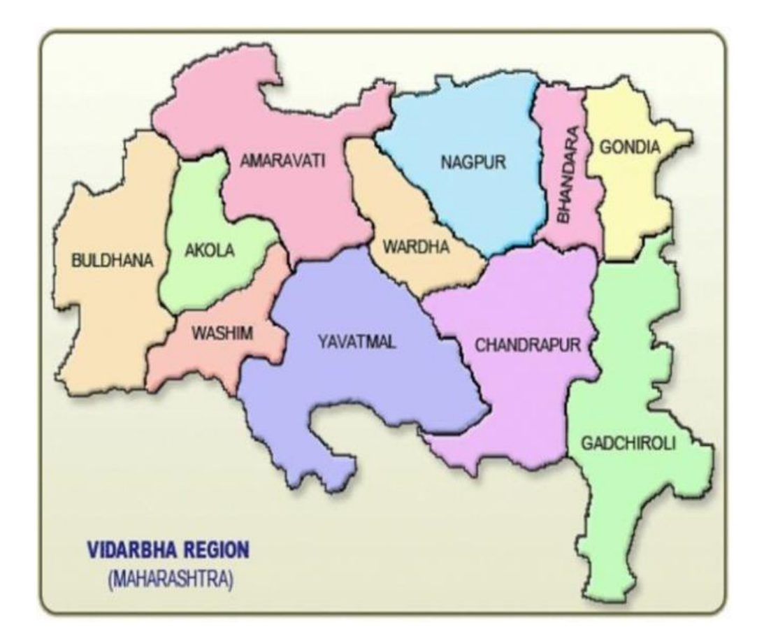
Fig. 2. Map of Vidarbha Region of Maharashtra

Bhandara and rearings were conducted in outdoor condition on the foliages of Terminalia tomentosa and Terminalia arjuna . The nonadopted seed cocoon rearers were supplied 300 Dfls produced at BSM&TC, Bhandara through the District Sericulture Departments of respective districts. The Non-Adopted Seed Cocoon Rearers conducted rearing without adopting any rearing technology (control) while Adopted Seed Cocoon Rearers adopted the improved tasar silkworm rearing technologies (treatment) as detailed below: