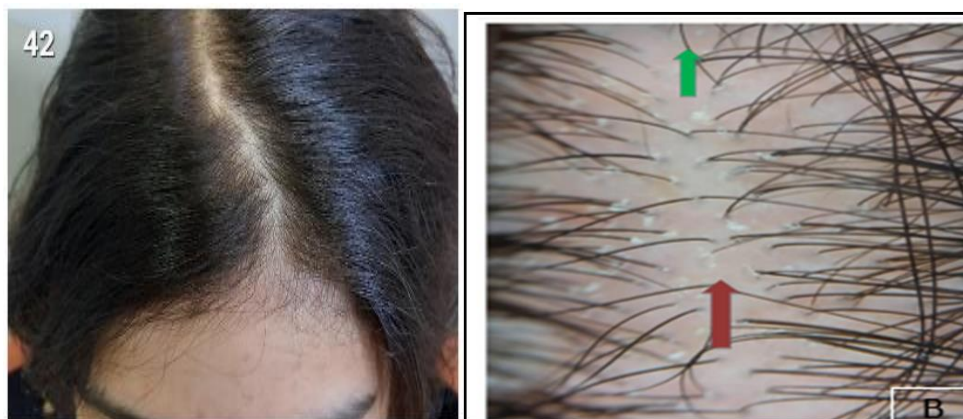
Fig. 1. (a) A 28 –years old woman with post covid TE (x50)s (b) Trichoscopy showing features of telogen effluvium in the form of empty follicles (red arrows) and short regrowing upright hair (green arrows)