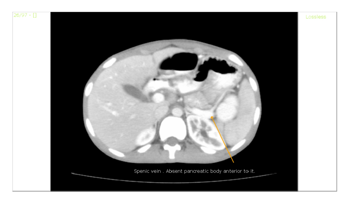
Fig. 2. CT scan image at level of splenic vein showed absence of pancreatic body anterior to it