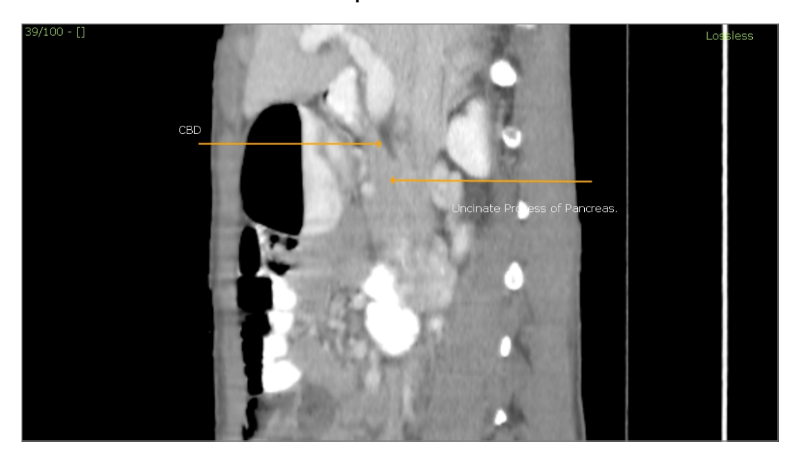
Fig. 5. Sagittal reformatted image revealed uncinate process and CBD