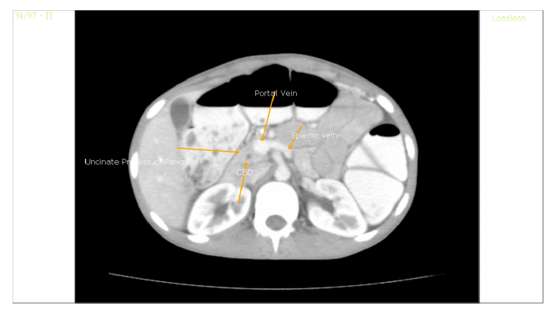
Fig. 1. Axial CT scan image of upper abdomen at level of portal confluence revealed uncinate process of head of pancreas with CBD. Anterior to splenic vein pancreatic body is not seen

An 18 year old male patient presented with fever, chills abdominal pain and vomiting along with diabetic ketoacidosis; initial US did not visualize the pancreas, a CT was obtained and revealed an absence of the body & tail of pancreas. (Figs. 2, 3 and 4). The Uncinate process of pancreas was seen (Figs. 1 and 5). MRCP was done, and it showed an absence of pancreatic duct (Fig. 6). The patient was managed with symptomatic treatment, IV fluids, IV potassium supplementation, and insulin. The patient's clinical condition improved and was discharged. The patient is now on treatment with insulin for diabetes and is being followed up at regular intervals.