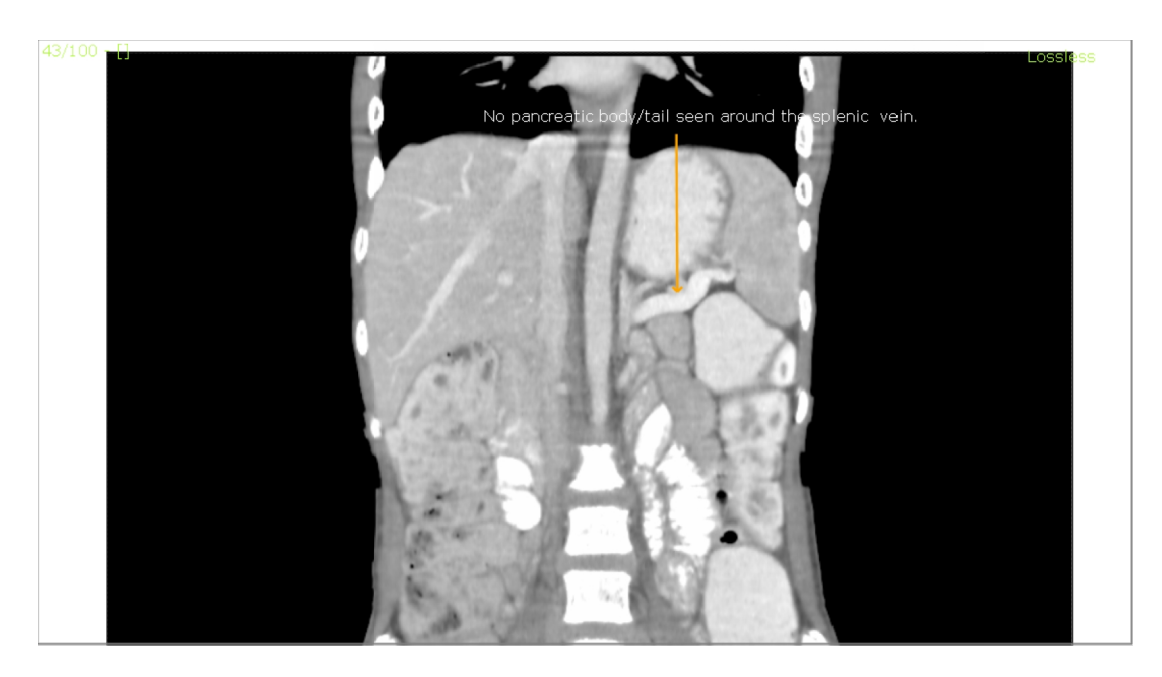
Fig. 4. Coronal reformatted image reveals absence of pancreatic tissue around the splenic vein