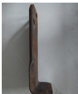
Fig. 3. L-type strip-till blade selected for the optimization