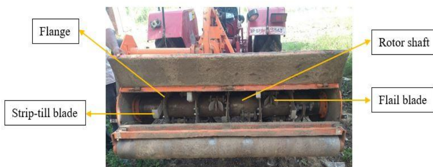
Fig. 4. Mounting of flail and strip-till blades on rotor shaft of stubble managing unit of the proposed machine