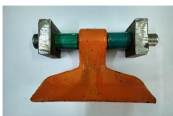
(ii) Hammer blade - H