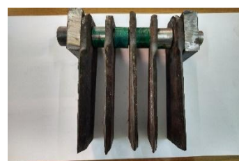
(iii) Straight blade - I