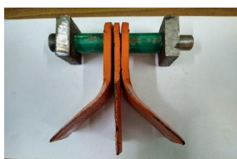
(i) Inverted gamma blade - Y