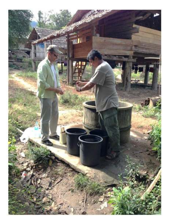
Fig. 2. Sampling wells in the village. Note the concrete apron base is exposed. Well rings were fully cemented, but no wells had covers

represents the rainy season and because of challenges driving the 8 km dirt trail to the village during this period, sampling was repeated only once more for the rainy season, October, 2012. Sampling was done in the wells during the dry season in March, 2012; December, 2012; June, 2013; and November, 2013.