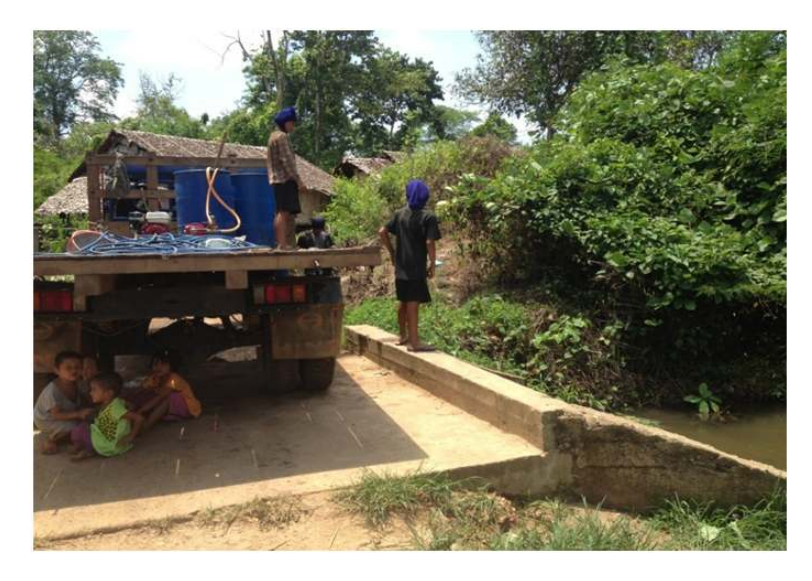
Fig. 5. Mixing pesticides using the village stream water

distance from pit latrine to well, as identified for the specific households, was 315 m (n=7), with a range of 100-500 m. The WHO minimum suggested distance between pit latrine and drinking water source is 30 m, so the surveyed families seem to meet this guideline. However, the steep slopes of the village, combined with the number of pigs tied under homes, and the presence of E. coli in well samples, suggest there may be more rapid percolation and downslope movement than desired and this issue should be examined through a more thorough survey of all latrine and well locations in the village.