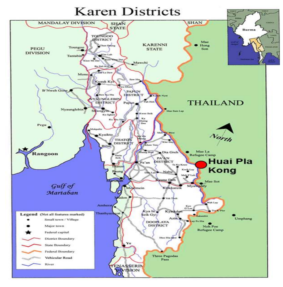
Fig. 1. Location of Huai Pla Kong Village (after Karen Human Rights Group, 2005, http://www.khrg.org/sites/default/files/khrg05f5.pdf)

Huai Pla Kong village, the site for this study, is located in Tak Province, Thailand, about 430 km northwest of Bangkok and 60 km from Mae Sot, the nearest city (Fig. 1). The last 8 km to reach the village are over a single lane dirt trail, making the village quite remote. Furthermore, the village is only 300 m from the Moei River that separates Thailand and Myanmar. The village has an estimated population of 568, primarily Karen Hill Tribe people, with most of the older population originally coming from Myanmar. The village is not a formal refugee camp but because of the proximity to Myanmar, security is strictly maintained by the Thai military and access is limited.