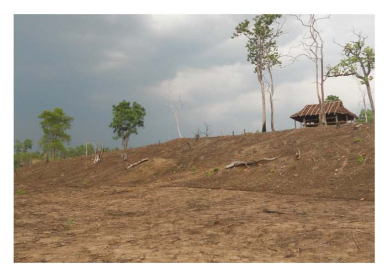
Fig. 8. Bare fields and steep slopes

The mean response on the Likert Scale question regarding frequency of washing hands after defecation was 3.8, which means the surveyed households regularly wash their hands, although 5 families specifically noted that they do not have soap to wash with. The households that defecated in the open tended to wash their hands less frequently. We also need to determine generally where and how people wash their hands (e.g. whether they dip their hands into the water storage containers).