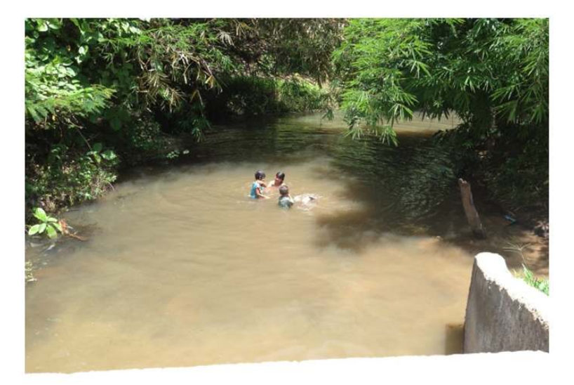
Fig. 6. Swimming after laborers mixing the pesticide had departed