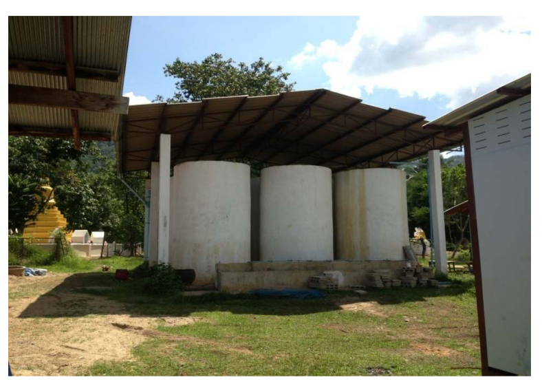
Fig. 9. Existing rainwater harvesting system for the village school

As the students observed the village further, conducted water testing, and talked with villagers when possible, they soon made a connection between potable water and sanitation. This underscores the importance of "familiarisation" with a study area, as discussed by Ghosh [50]. The students understood that simply digging more wells may not be the solution to