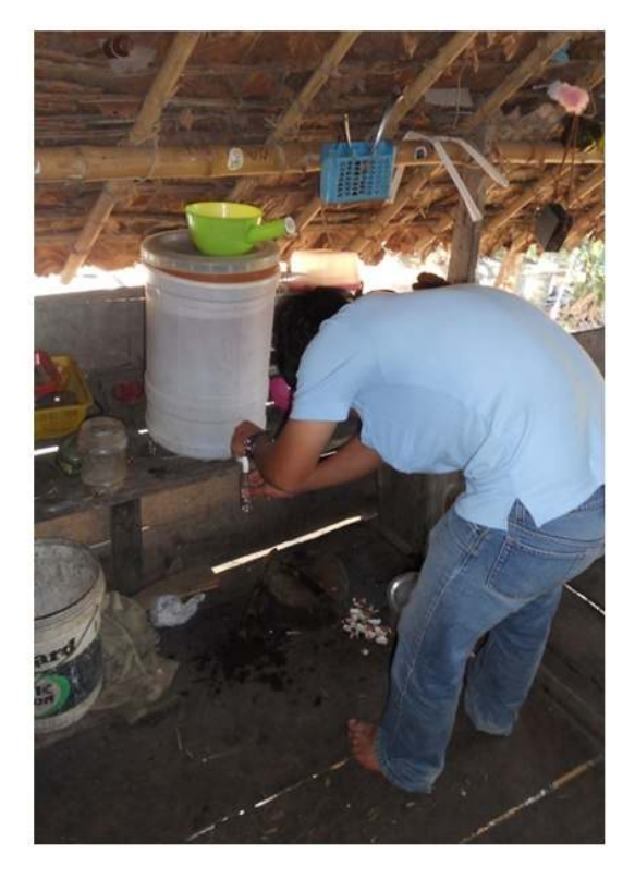
Fig. 4. Sampling the water from the ceramic filter for E. coli analysis

a considerable crowd. As a follow-up, in October, 2012, the team provided the mother with a ceramic drinking water filter produced by Resource Development International – Cambodia (RDIC, <u>http://www.rdic.org/</u>), a group with whom we have worked for a number of years previously in Cambodia, and whose filters have been shown to be effective [43]. Follow-up visits were conducted to assess the effectiveness of the filter, including analysis of the filtered water using the Coliscan Easygel system, per the methodology described in the previous section (Fig. 4).