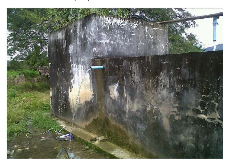
Fig. 3. Concrete water storage tank for the community and Buddhist monastery

Fig. 2. Sampling wells in the village. Note the concrete apron base is exposed. Well rings were fully cemented, but no wells had covers