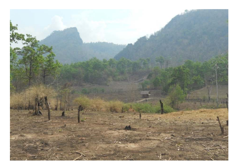
Fig. 7. Swidden agriculture in Huai Pla Kong