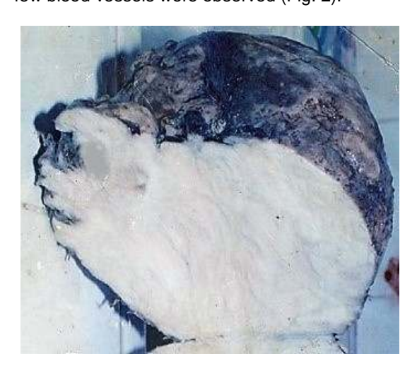
Fig. 1. Left Breast fibromatosis resected specimen

fibroblastic proliferation, which was rich in collagen without atypia, no images of mitosis. In some areas, simple mesenchymatous tissue and few blood vessels were observed (Fig. 2).