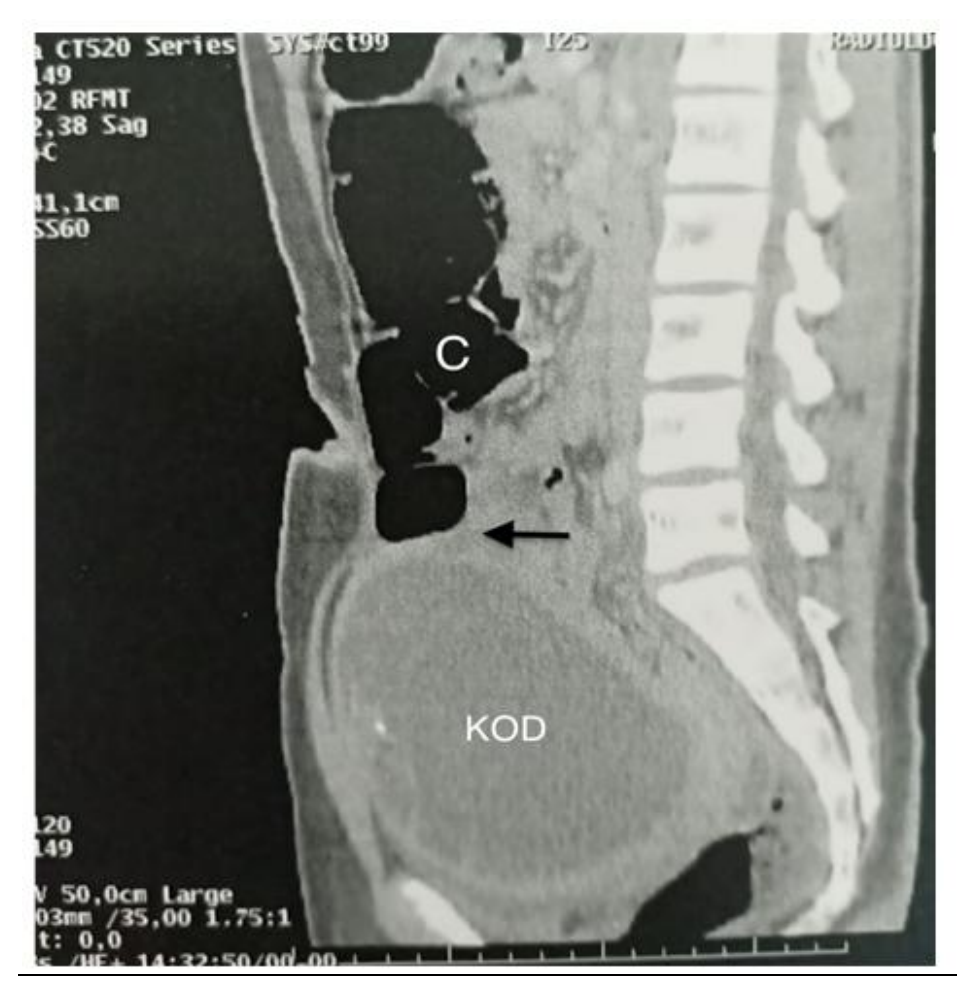
Fig. 1. CT image showing a large ovarian cyst in pelvic position exerting a mass effect on the recto-sigmoid hinge

distension with pelvic tenderness, the rectal ampulla was empty on rectal examination. A PSA objectively showed colicky water-aerobic levels. CT scan confirmed colonic occlusion upstream of a large cyst probably of ovarian origin measuring 18 X 12 cm (Fig. 1). Exploratory laparotomy revealed the presence of a large ovarian cyst measuring 20 x 15 cm (Fig. 2), twisted into two turns of coils with total necrosis of the right adnexa, compressing the recto-sigmoid hinge by its root, with the presence of a zone of constriction (Fig. 3), causing colic and hail distension upstream. A right annexectomy was performed and the obstacle was removed (Fig. 4). The postoperative course was straightforward. Histological examination was in favor of a functional benign ovarian cyst.