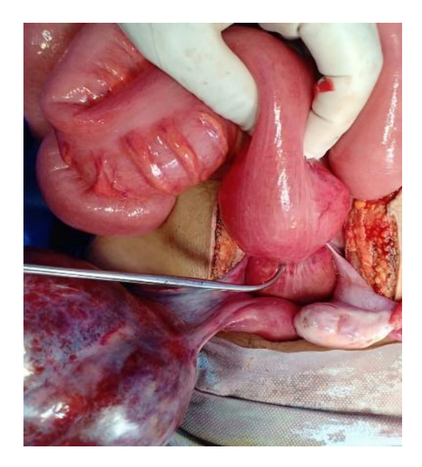
Fig. 3. Intraoperative image showing the area of constriction at the recto-sigmoid hinge after distortion of the cyst