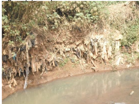
Fig. 2. (b) adjacent river banks of the wetland of Bamenda Municipality Cameroon with artifacts