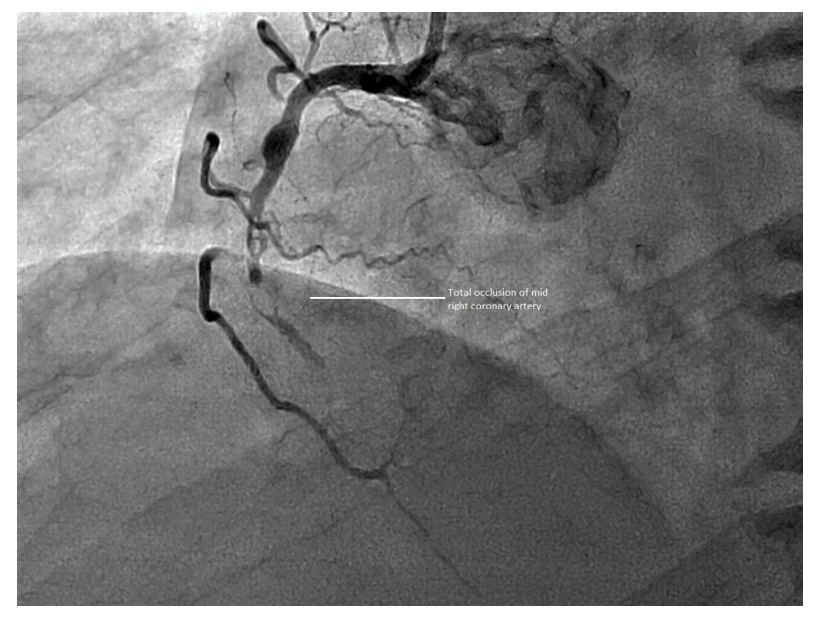
Fig. 3. Coronary angiogram showed total occlusion of mid right coronary artery