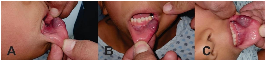
Fig. 1. An increase in volume can be seen in the lower left lip, brown in color, with well-defined edges and a sessile base. A) Lateral view of the left lower lip showing an increase in volume that extends from the lip to the bottom of the sac. B) frontal view of the tumor lesion that extends from the midline to the corner of the lips. C) Superior view that extends from the vermilion of the lips to the mucosa of the oral cavity

After the surgical act, the tutor refers to a post-surgical evolution at 22 days of resection of the lip lesion, she refers to a good evolution, with 100% satisfaction with the result. On physical examination, the vermilion border is seen without a solution of continuity, an adequate white and red lip union with the presence of separation of the dry and wet lip in the process of fibrosis, no evidence of infection or bleeding from healing (Fig. 2) (Fig. 3).