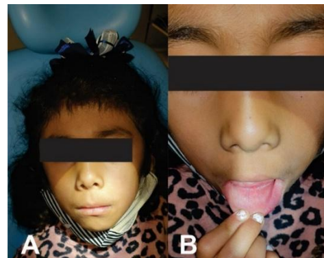
Fig. 3. A) Post-surgical physical examination at 22 days, normochromic tissues are appreciated, without pathological data. B) Intraoral examination shows normochromic tissues, normothermic, without pathological data

The surgical procedure was the treatment of choice due to the lack of sophisticated equipment to perform other procedures indicated in the literature, which is why the economic situation of the patients should be considered in search of the best therapeutic options.