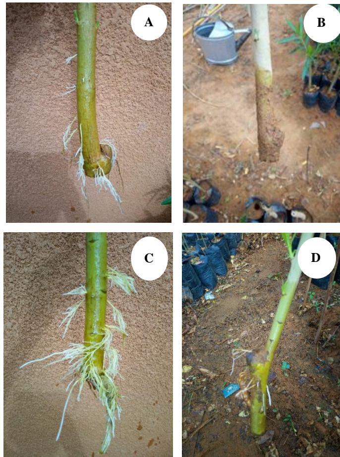
Photo 2. Illustration of the development of the root system of oleander cuttings. (A): in water at 2 weeks; (B): in soil at 2 weeks; (C): in water at 4 weeks; (D): in soil at 4 weeks