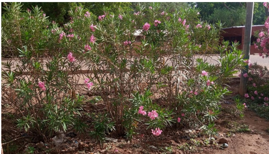
Fig. 2. Laurel hedge on the main road at Abdou Moumouni University in Niamey