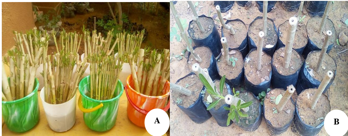
Photo 1. Treatments carried out on the cuttings: (A) Cuttings placed in water; (B) Cuttings directly in pots

Photo 2 illustrates the root development of oleander cuttings in water and in soil.