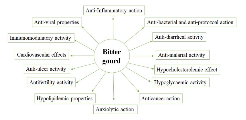
Fig. 3. Medicinal properties illustration of bitter gourd

Previous studies proved that the consumption of saponin-free methanolic extract remarkably reduced the glucose content in normal and insulin-dependent diabetes (IDDM) [15]. It also contains insulinsubstitute compounds polypeptide P, which can be useful for diabetic patients [16]. Previously researchers showed the anti-diabetic characteristics of bitter gourd after feeding animals with bitter gourd [17-19]. In the present review, we have elucidated the possible medicinal potential of bitter gourd (Fig. 3), and its extract against several diseases (Table 2). The health-promoting benefits of bitter gourd from previous studies were also shown in this studv. Moreover, the mechanism behind the effectiveness of bitter gourd against diseases was also explained in our current review.