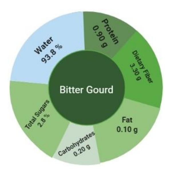
Fig. 2. Nutritional Composition of bitter gourd (adopted from [8])

Hussain et al.; JPRI, 34(37A): 66-76, 2022; Article no.JPRI.86721