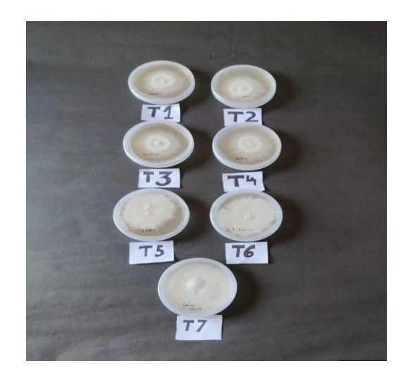
Fig. 2. Radial growth of Phytophthora infestans on PDA with different concentrations of Kresoxim methyl 44.3%

Singh et al.; J. Exp. Agric. Int., vol. 46, no. 11, pp. 762-767, 2024; Article no.JEAI.127174