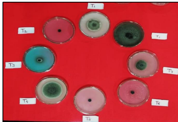
Plate 1. Efficacy of different fungicides against A. helianthi under in vitro condition

Akbari and Parakhia [15] estimated the efficiency of various systematic fungicides against the Alternaria alternata . Results revealed that hexaconazole 5 EC and propiconazole 25 EC, showed similar effectivity which completely suppressed the growth of pathogen. Saqib et al. [16,17] reported that hexaconazole exhibited most effective as it achieves 100% inhibition of A. helianthi .