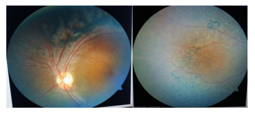
Fig. 1. Retinophoto showing pigmentary retinopathy bilaterally

A few precautions have been suggested to slow the progression of the disease, such as wearing protective lenses with filters, and wearing a hat with a visor. Unfortunately, to date, there is no curative treatment for retinitis pigmentosa. genetic advice has been offered to the parents.