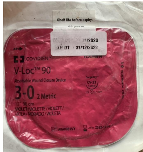
Fig. 4. 3-0 knotless suture (Covidien V-loc 90 knotless absorbable wound closure device)