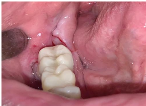
Fig. 2. Suturing with 3-0 knotless suture after surgical removal of 48