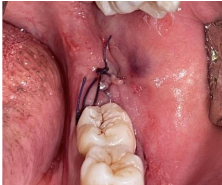
Fig. 1. Suturing with conventional 3-0 vicryl suture after surgical removal of 38

statistics was expressed in mean, standard deviation and frequency, percentage based on the obtained data. As this was a split mouth study, the paired t-test was used to compare the mean intraoperative suturing time values between the control and experimental groups. Landry's wound healing indices between the two groups were compared using the Mann Whitney test. The significance level was set at P < 0.05 with a confidence interval of 95%.