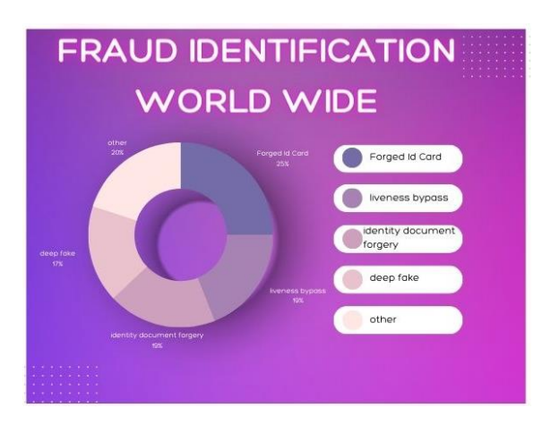
Fig. 1. Worldwide Fraud Identification report

Cinar; Asian J. Res. Com. Sci., vol. 16, no. 4, pp. 178-193, 2023; Article no.AJRCOS.107650