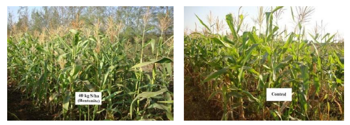
Plant height at 90 DAS