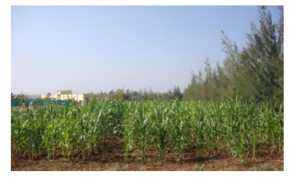
Plate 1. General view of experimental unit

A field experiment was conducted during rabi season of 2011 at Saidapur farm, University of Agricultural Sciences, Dharwad, India. The experiment was laid out in a randomised complete block design (RCBD) with factorial concept in three replications (Plate 1) Treatments comprised two sources of sulphur (i) Gypsum (ii) Bentonite pastilles and their five levels (10, 20, 30, 40 and 50 kg S ha<sup>-1</sup>) and a control treatment without sulphur. Prior to conducting an experiment, sandy clay loam soil with deficient in available sulphur (<10 ppm) was chosen to assess the true response of maize to sulphur application. All treatments included the