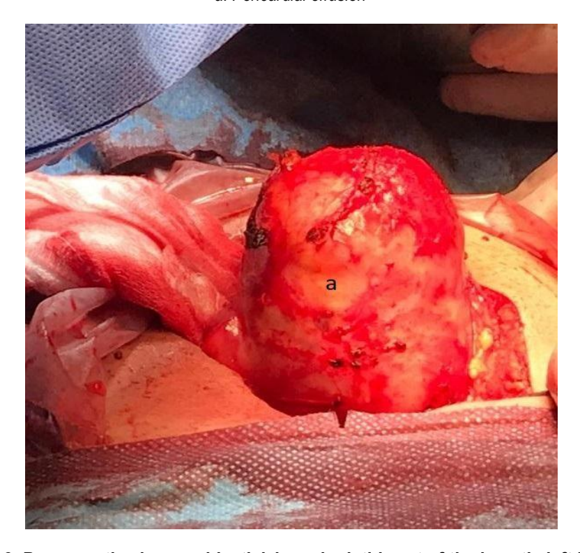
Fig. 3. Per-operative image objectivizing a hydatid cyst of the hepatic left lobe a: Exophytic hydatid cyst