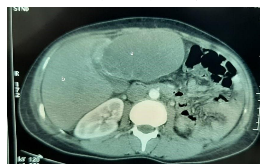
Fig. 1. Abdominal CT scan showing a hydatid cyst of the left lobe of the liver a: Hydatid cyst. b: Right lobe of the liver

A muffled heart sound was found on auscultation. The chest X-rav showed cardiomegaly and the ECG showed a microvoltage. Abdominal ultrasound was in favor of a type III hydatid cyst at the expense of the left lobe of the liver. Thoracoabdominal CT confirmed the presence of a hydatid cyst of the left lobe of the liver, 14 cm long, multivesicular, probably ruptured in pericardium with pericardial effusion of medium abundance (Figs. 1-2). The heart ultrasound confirmed pericardial effusion without vesicle visualization. serology was positive. Hvdatid exploration showed an exophytic hydatid cyst occupying the left lobe of the liver measuring 15 cm long axis adhering in part to the diaphragm (Fig. 3). The patient underwent partial cystectomy of the hepatic hydatid cyst with emptying of its vesicular and membranous contents. Disconnection of the cyst from the diaphragm showed the fistulous orifice (Fig. 4) with rock-water outflow through the pericardial cavity. Closure of the cysto-pericardial fistula after subxiphoid pericardial drainage was achieved. The patient was hemodynamically unstable during the procedure. The immediate postoperative period was marked by the death of the patient in a septic shock.